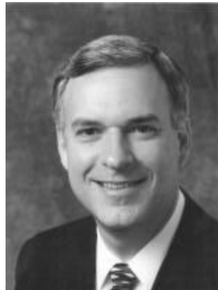
Robert Eckels County Judge