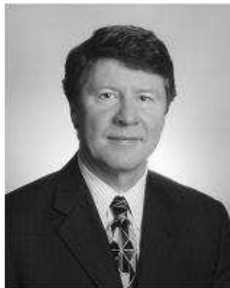
Ed Emmett County Judge